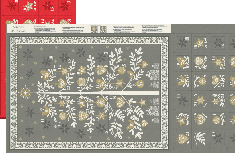
1970 R and S Scandi 2018 Advent Calendar Panel